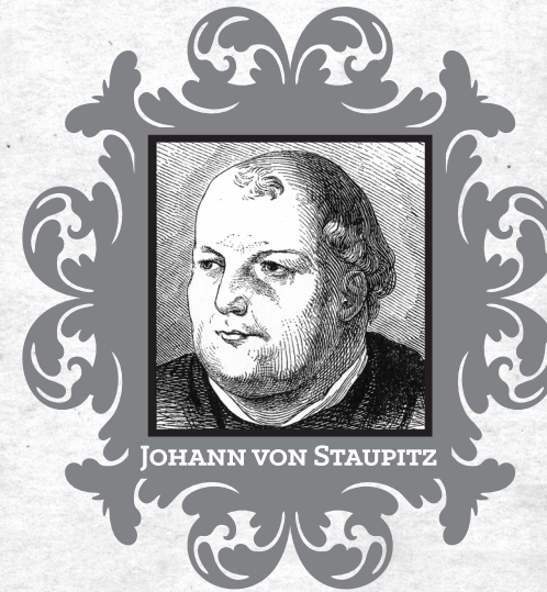
JOHANN VON STAUPITZ