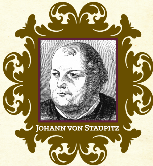
JOHANN VON STAUPITZ