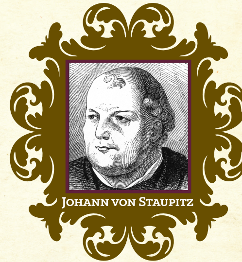
JOHANN VON STAUPITZ